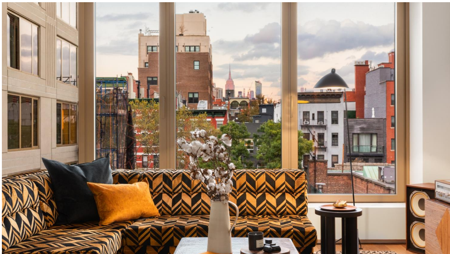
In the model unit that Kravitz Design recently completed in 75 Kenmare, a vintage Milo Baughman sofa in a graphic-print fabric is a living room standout.

For Grammy Award–winning musician Lenny Kravitz, it seems that rock and roll infuses everything he touches. Maybe more surprising: So too does a spirit of warmth and relaxation. Now, in New York City's Nolita neighborhood, there is a physical manifestation of this enveloping mood—at 75 Kenmare, the first New York City building with interiors by Kravitz Design. (Andre Kikoski Architect designed the architecture.) Today, AD reveals the model units for the 38-apartment tower, one by Kravitz and the other by AD100 ASH NYC, where the rocker's inspirations are as personal as his music.