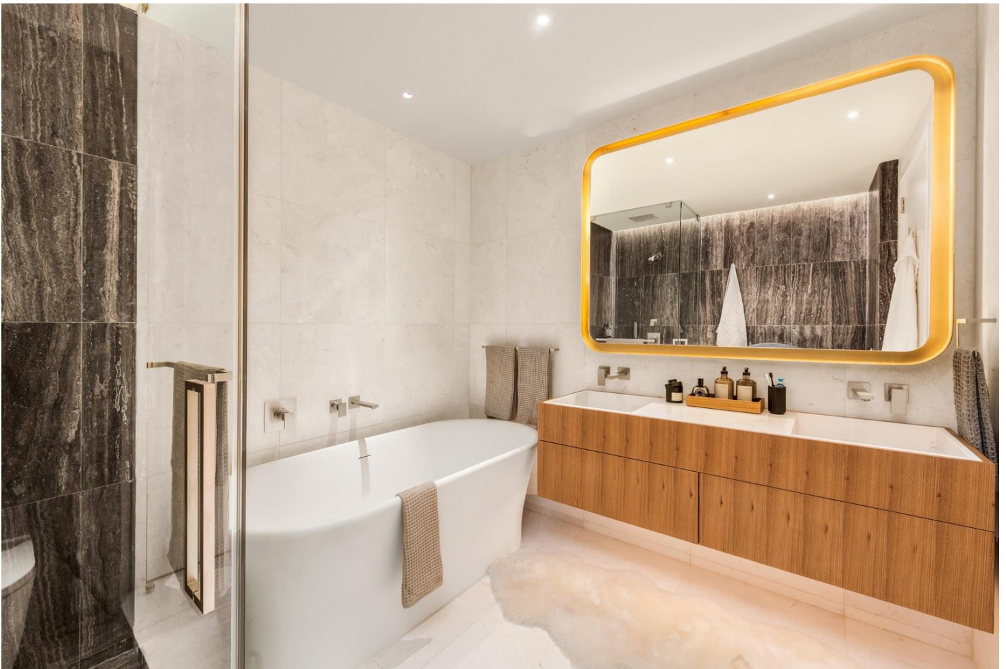
The master bathroom features an elm vanity and a brown travertine shower (at left). Cream-colored marble wraps the walls and floor.

In the residences, "the material choices all follow the vibe of the lobby," comments Kravitz, while his model unit taps into his personal style, a relaxed eclecticism with global furnishings. The living room standout is a vintage Milo Baughman sofa in a geometric-print fabric, whose caramel and black colors are highlighted by a CB2 credenza and the graphic rug from Mansour Modern. While the master bedroom skews more muted and Danish, with its low bed and metal-and-walnut side table by Kravitz Design for CB2, a shapely bed by metal artist Gary Magakis makes the guest bedroom a bold type. "It's a nice blend of classic and contemporary furniture, vintage, global pieces, shapes, and patterns," he describes. "The only poppy element is a wallpaper [by Chris Wyrick] that's got this black-and-white Oscar Neimeyer-inspired pattern." It decorates the living room, where a Børge Mogensen chair and a black side table by Matter sit in front of it.